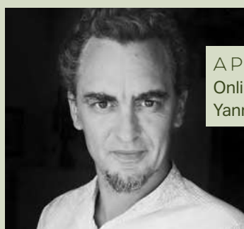
APRIL 8 Online seminar with photographer Yannick Cormier (FRA))

At the same time, Relating Forests France proposes a gaze exchange on the forests, between imaginaries and reality to an adult audience. Using 3 artistic proposals, storytelling, theater, masks, it aims at enhancing awareness of the living in the forest in a participating way.